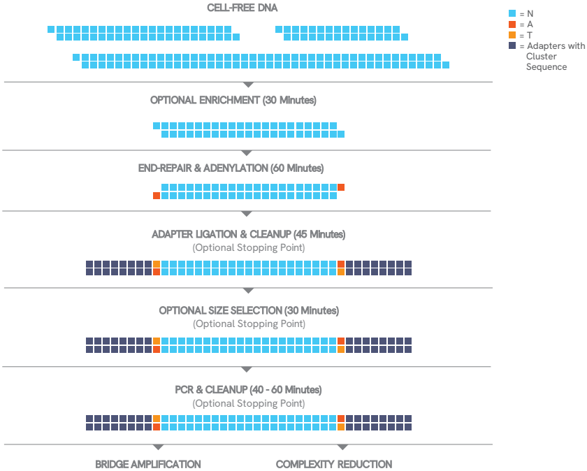
Figure 1: Sample flow chart with approximate times necessary for each step.